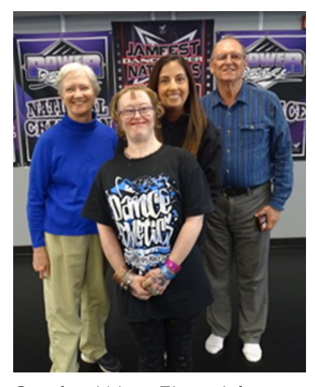
Get the 411 on Financial Planning

Syndrome World Magazine<sup>TM</sup> or social media! <u>Submit your photos here</u>.