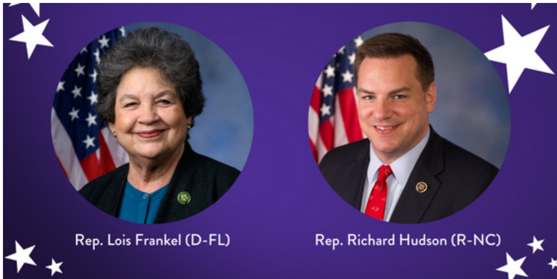
Rep. Lois Frankel (D-FL)